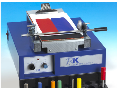
Below: K Control Coater model 101

The K Control Coater is widely used for the application of paints, varnishes, adhesives, liquid printing inks and many other surface coatings to produce quick, accurate and repeatable samples. These may then be used for quality control and presentation purposes, R&D, computer colour matching data etc. These are elements vital to a company's success in the modern world.