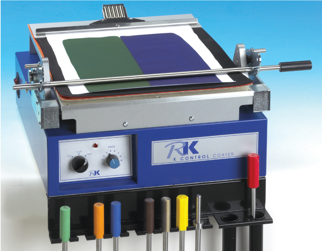
Above: K Control Coater model 202